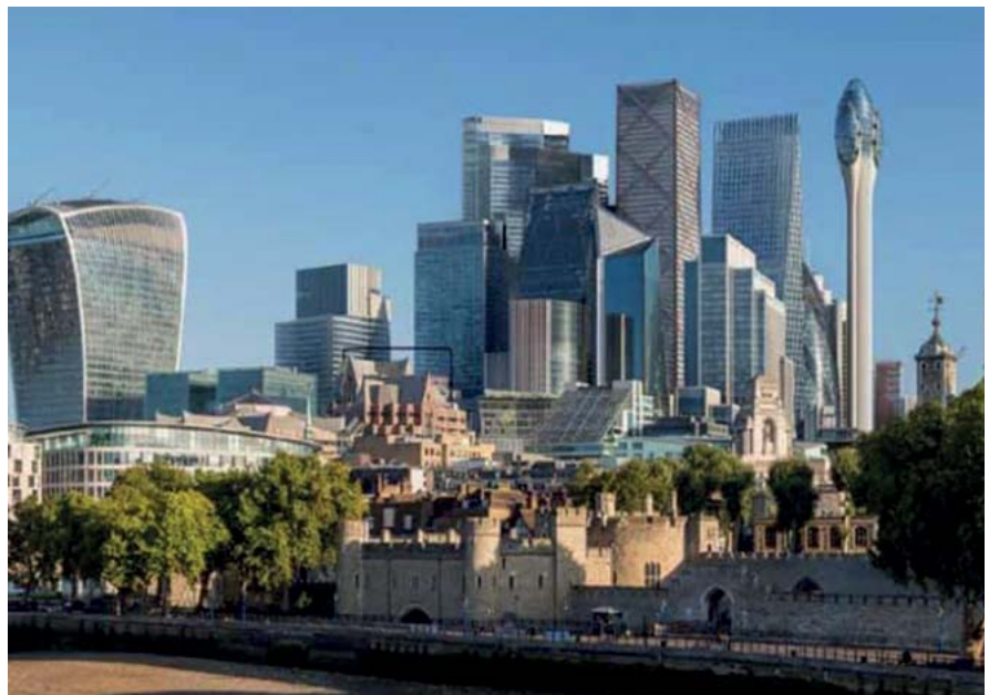
How the City may look in 5 years' time. The distinctive 'Tulip' is to the right of the picture

The skyline of the City has changed enormously over the last few years and with further building in progress and planning applications granted the 'Eastern Cluster' overall development is concluding. One unusual additional building granted planning permission (though subject to London Mayoral and Government approval) is the 'Tulip' building – unusually for the City this will not be primarily for office use but will be a leisure and tourist destination with numerous viewing galleries, bars and restaurants. The site is adjacent to, and proposed by the developers of, the famous Gherkin on St. Mary Axe.