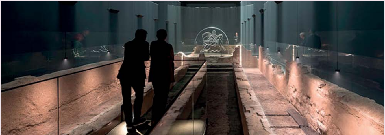
London Mithraeum Bloomberg Space

Londoners are well known for not visiting the City's biggest tourist attractions like the Tower of London, Westminster Abbey and Buckingham Palace. Maybe it's the queues and crowds that are to be avoided and on a busy workday a visit would take much longer than a lunch break. But here are 3 of my favourite very local attractions well worth a visit and can be appreciated within one hour.