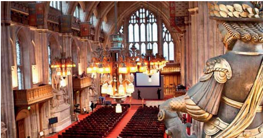
The Guildhall Great Hall

Amphitheatre – hear the roar of 7,000 spectators eager to watch wild animal fights and criminal executions, Guildhall Library – enjoy an exciting programme of exhibitions, events, guided walks, talks, book launches and evening entertainment., Guildhall Great Hall – take a peek at the City's only secular medieval building which dates back to 1411, St Lawrence Jewry – the official church of the City Corporation, built after the Great Fire of London, one of the most impressive churches designed by Sir Christopher Wren, City of London Police Museum – journey through the history of the City of London Police and see some precious and unusual objects along the way.