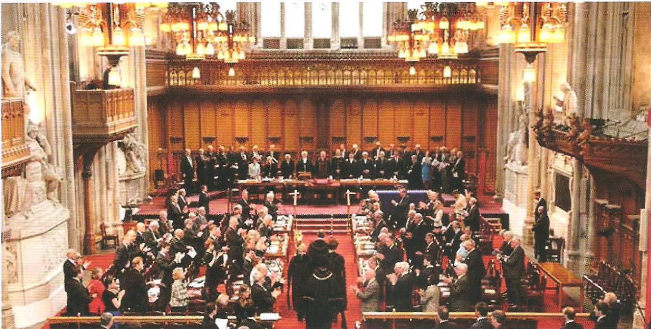
The Court of Common Council meeting at Guildhall

With electoral registration taking place this autumn and with elections in 2017 we answer local worker and residents' questions about how the City of London works