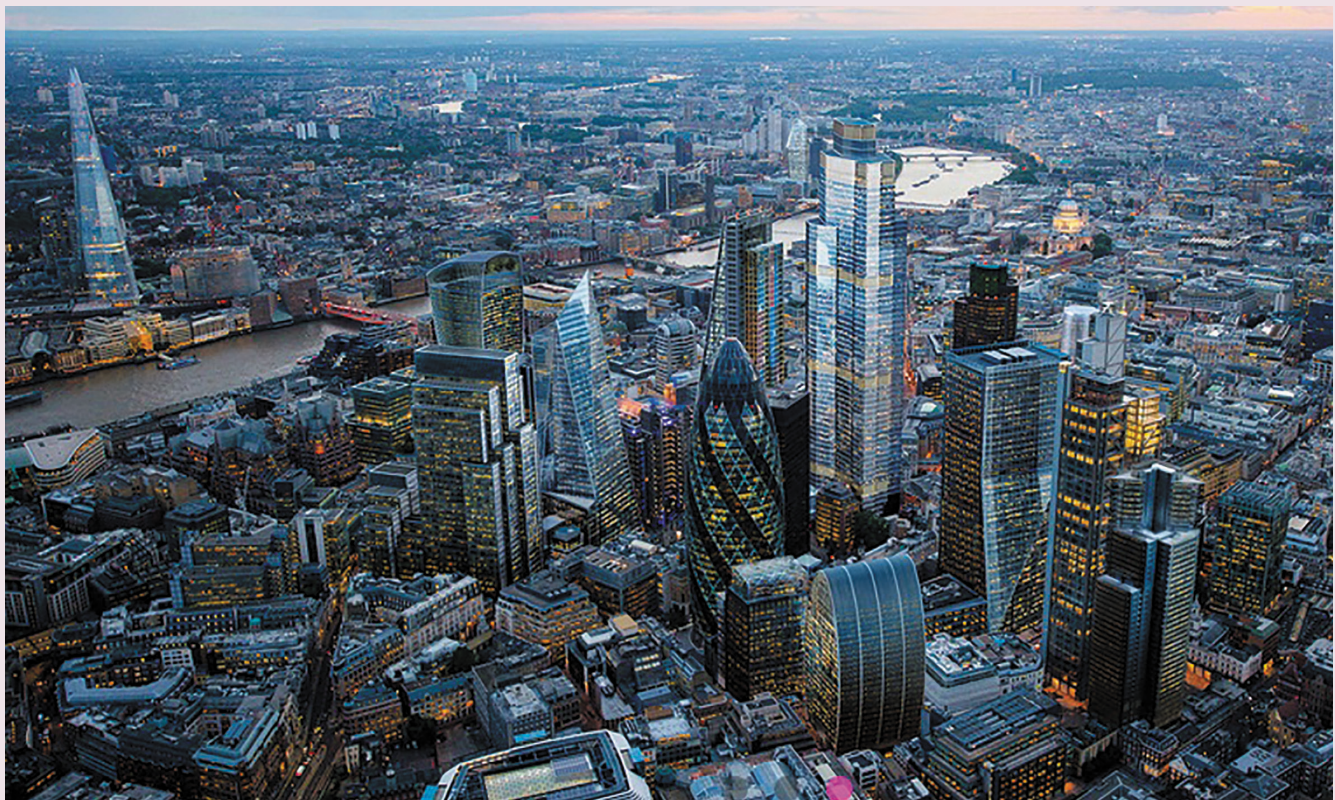
An artist's impression of the Eastern Cluster with the proposed buildings shown.

If you would like to chat about what's going on in the City relating to Planning contact Councillor Peter Dunphy. Contact details of all of your representatives appear on the back page.